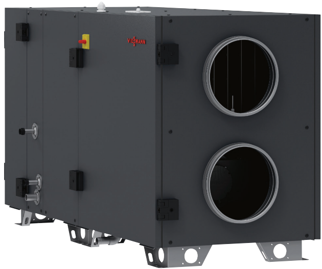
Vitoair CS PRO – suitable for indoor and outdoor installation

Vitoair PRO from Viessmann is a new, high performance ventilation solution that is equally well-suited to offices, children's nurseries, shops, meeting places and apartment buildings.