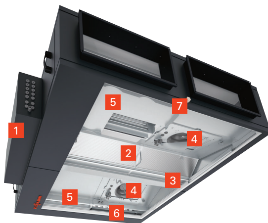
Vitoair FS PRO